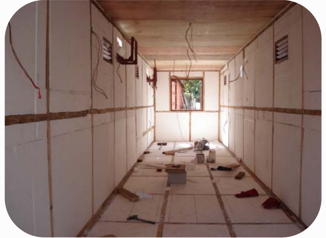
Installation of interior insulation panels